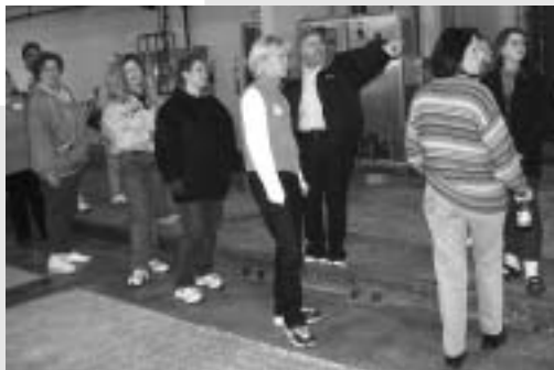
Educators attending Tulsa WET in the City workshops are treated to a guided tour of the Mohawk Water Treatment Plant.