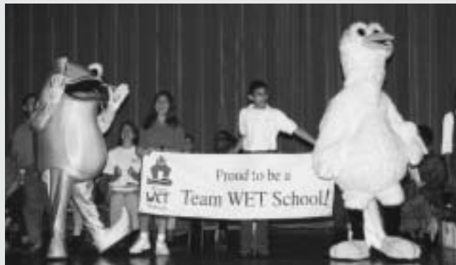
Catfish and Egret, the Storm Water Management Joint Task Force "Clean Water Clear Choice" mascots help Hogg Middle School students declare they are "Proud to be a Team WET School!"

We know that Hogg will prove to be an exemplary first Team WET School and model for the nation. Go Hogg!