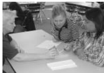
Is there water on Zork? Tulsa's educators find out during a WET in the City workshop.