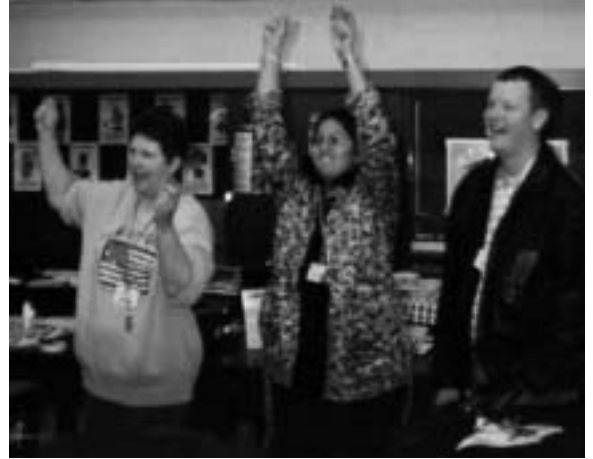
Enthusiasm abounds as Hogg Middle School teachers participate in sample water festival activities at "How to Organize a School Water Festival," the first workshop in the WET Kids™ series.

CEE is proud to announce a new series of professional development workshops, WET Kids™, for teachers, administrators, parents, students and other partners at Team WET Schools. Workshops in the WET Kids™ series foster increased environmental awareness, provide practical "how to" advice, and offer opportunities for hands-on experimentation and creative brainstorming to help schools implement a student-driven water stewardship action project on their campus or in their community. Topics include hosting school water festivals, implementing action projects, and conducting school water audits. Additional workshops will be developed as Team WET Schools propose innovative action projects for their students. For more information about Team WET Schools and the WET Kids™ water stewardship workshop series call 713-520-1936.